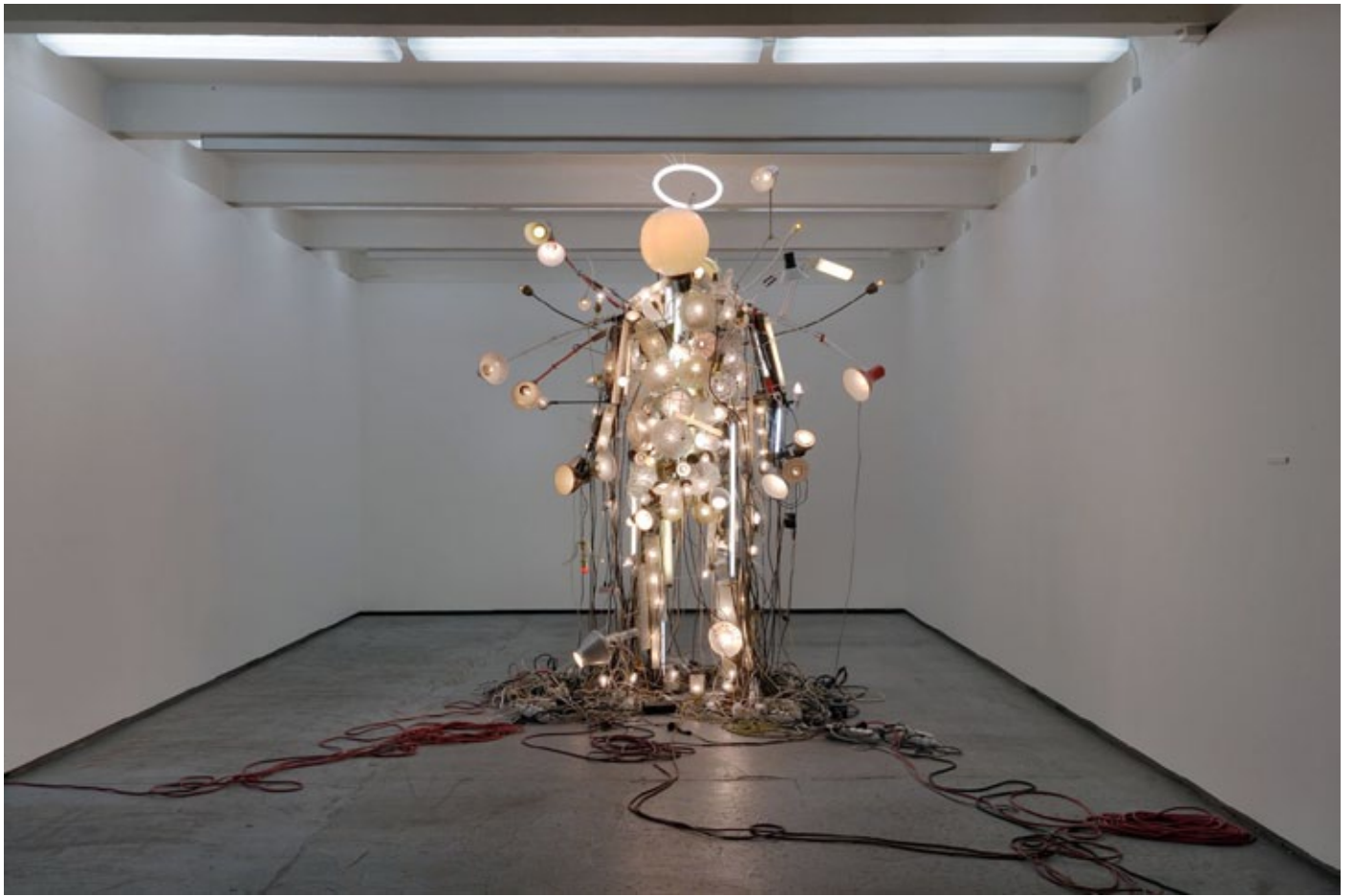
MY LIGHT IS YOUR LIFE (MODEL: SHIVA SAMURAI 5KW/50HZ), 2009 OLD LAMPS, CABELS, ELECTRONIC INSTALLATION, 305 X 230 X 140 CM